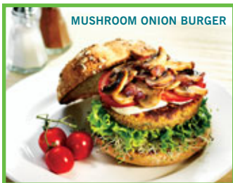
MUSHROOM ONION BURGER